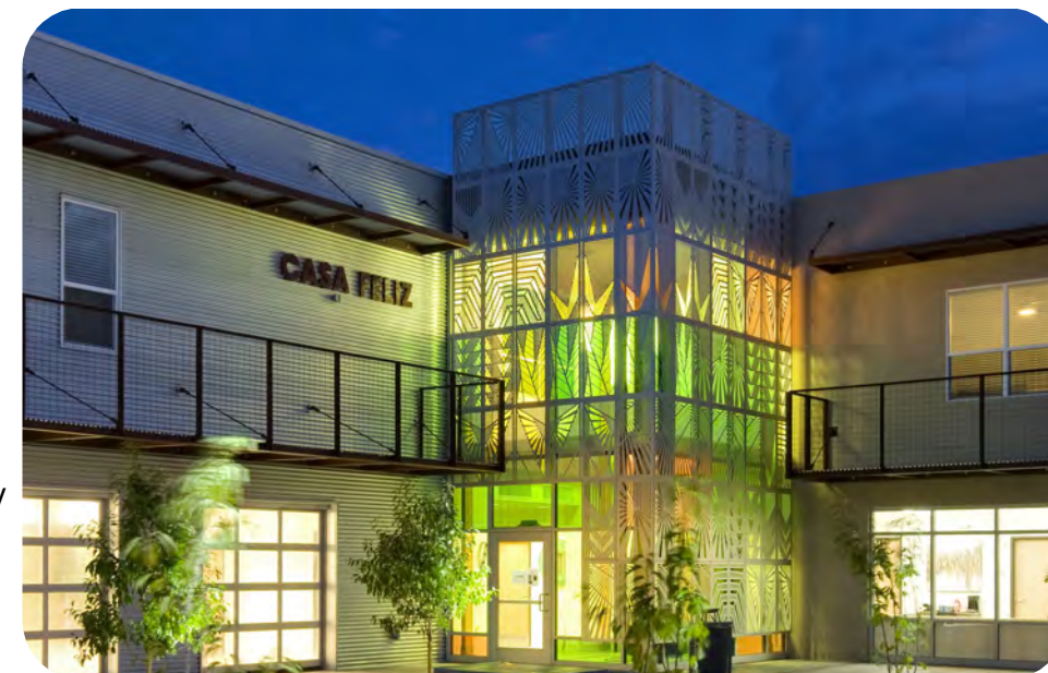
Casa Feliz's entry tower is wrapped in beautiful perforated aluminum panels depicting the many cultures represented in the International District