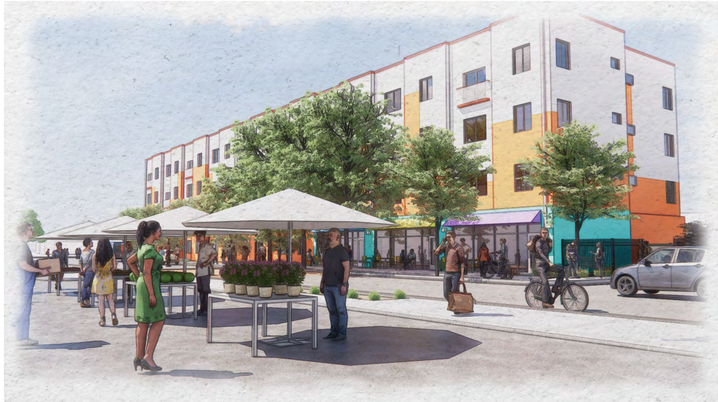
View from Alcazar St. Looking North - The adjacency of commercial space to Talin Market provides a very walkable neighborhood and the potential for farmer markets to return.