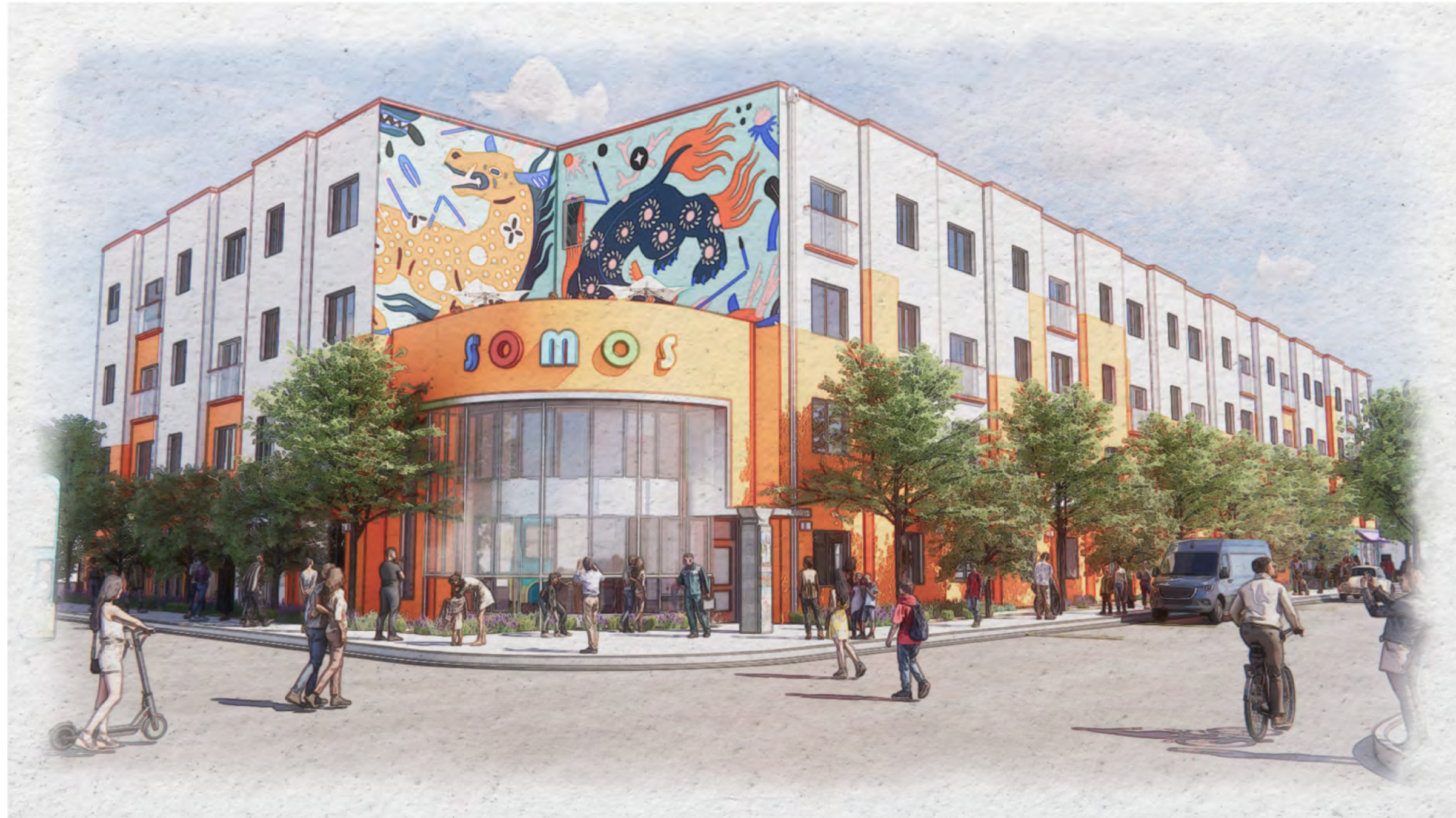
Corner of Central Ave and Alcazar St. - Looking at the Main Entry and two-story lobby with potential roof deck above