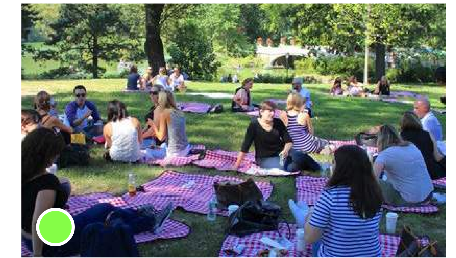
picnicking under trees