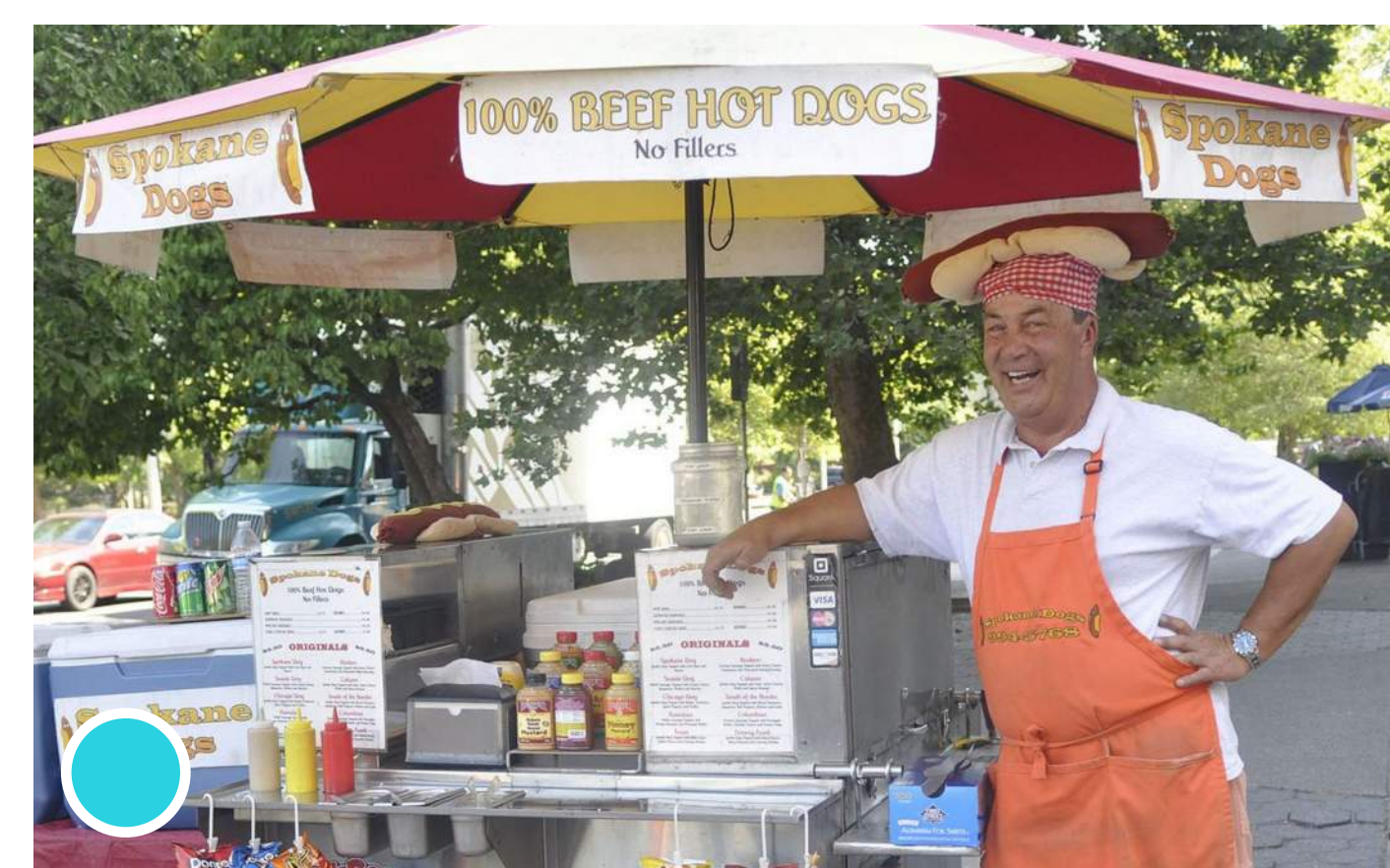
pop up vendors