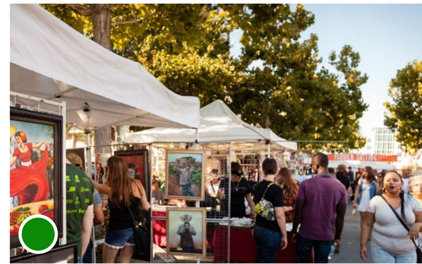
street fair/farmers market