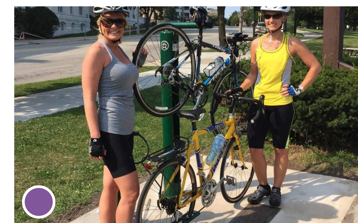
bike repair station