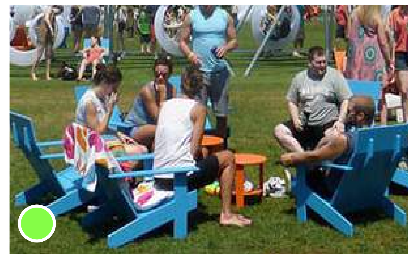
movable lounge seating