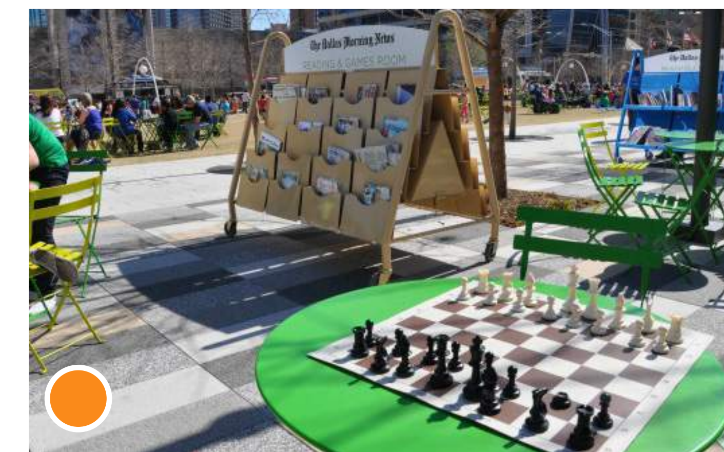
mobile library and games