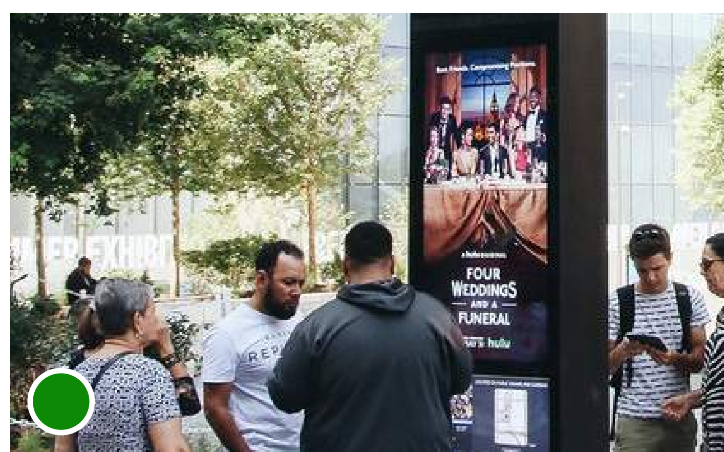
digital community kiosk