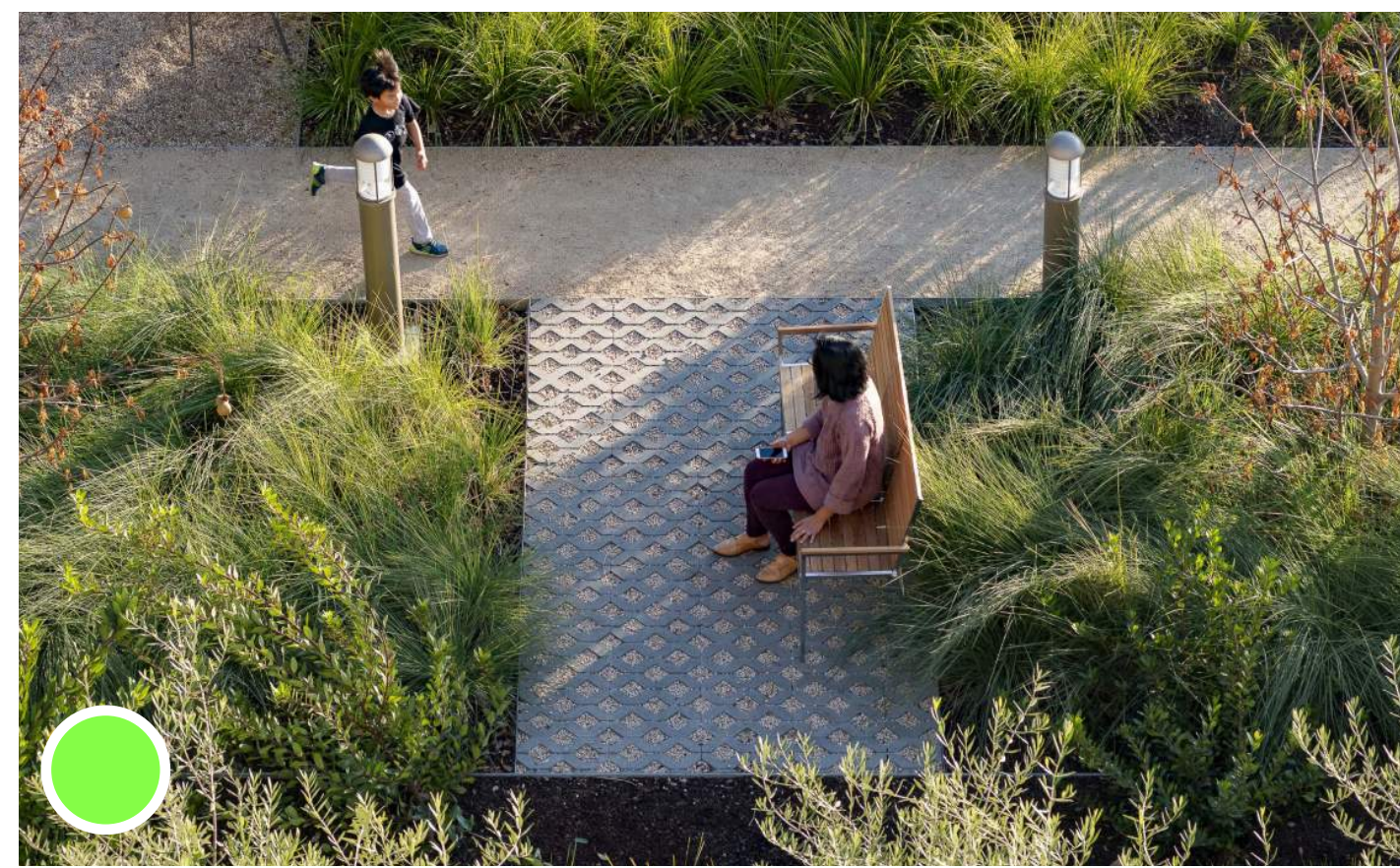
intimate seating with native planting