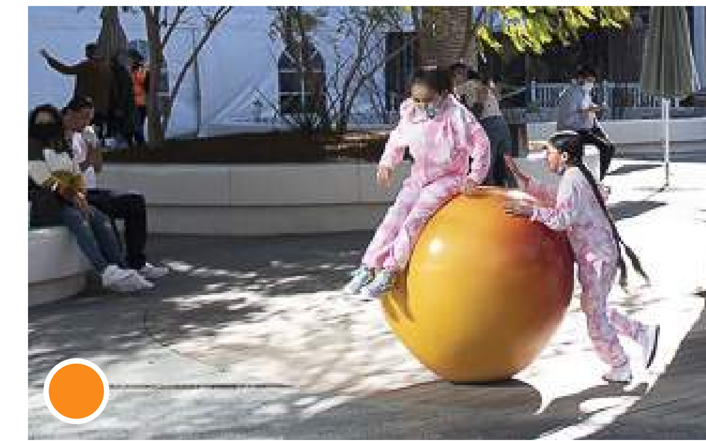
playful art installation