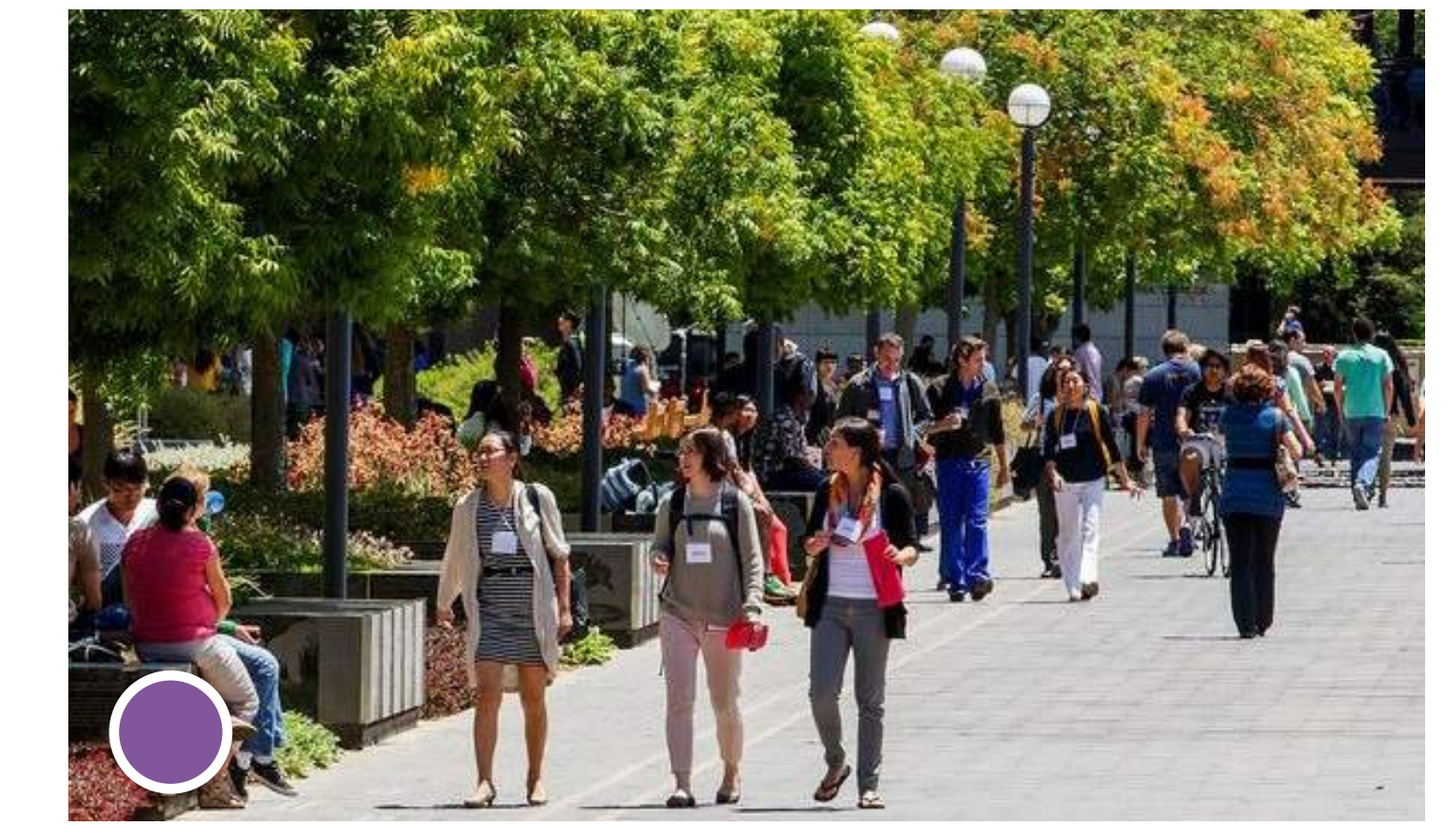
pedestrian and bike priority